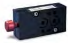
Block & bleed valves

All of the above fit together by way of standard product interfaces such as NAMUR for solenoid and switch box connections and ISO-5211 for valve flange connections. Using these well known international standards ensures that El-O-Matic products will comply with application requirements in projects worldwide