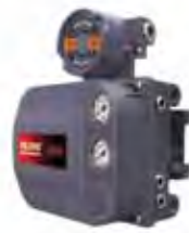
Digital valve positioners (DVC's)