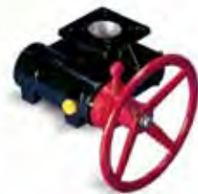
Manual override gear-boxes

In addition, these accessories often include dedicated options like;