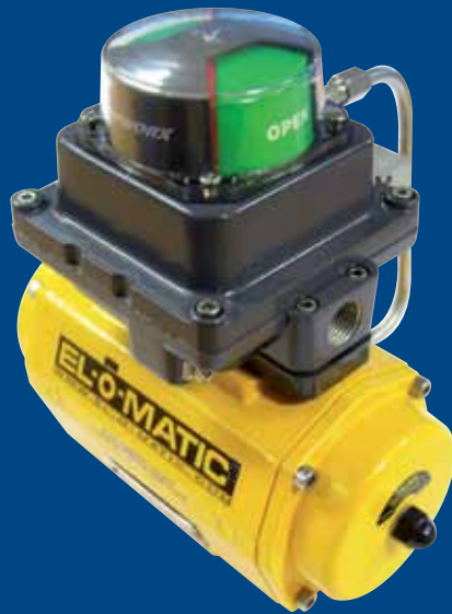
El-O-Matic actuators with TopWorx accessories