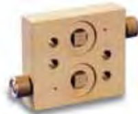
Speed control plates

In addition, these accessories often include dedicated options like;